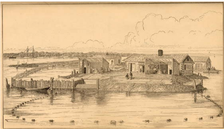
Grassy Island Pond-Fishery, Detroit River (from Milner 1874, Plate XXXVII). Whitefish captured in seines on fall spawning runs were maintained in the river in net pens for live sale throughout the winter.

To increase shipping traffic in the Detroit River, the U.S. government began large-scale engineering works in 1907 to increase the size of the shipping channels. Construction of the Livingstone channel resulted in removal of most of the historic whitefish spawning areas in the river mouth and created changes in river hydrology. The loss of these spawning grounds was a major contributing factor in the collapse of the whitefish fishery in the Detroit River in the early 1900's. Pollution, loss of wetland habitat, overfishing, and invasive species are other factors that caused ecological changes in the Detroit River and the entire Huron-Erie Corridor (HEC).