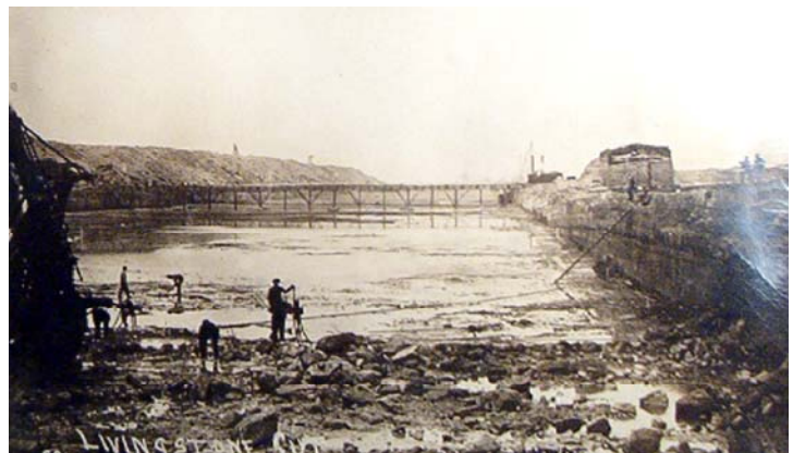
The Livingstone Cut under construction in the Detroit River, ca. 1910.