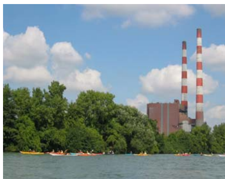
The Trenton Channel

This Refuge is the only International Wildlife Refuge in North America. The refuge includes islands, coastal wetlands, marshes, shoals, and waterfront lands along 48 miles of Detroit River and Western Lake Erie shoreline. It is uniquely situated in the heart of a major metropolitan area. Detroit River International Wildlife Refuge is one of over 540 National Wildlife Refuges managed by the U.S. Fish and Wildlife Service within the Department of Interior.