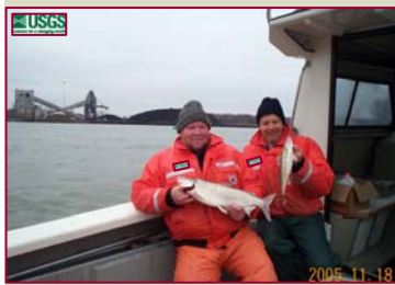
Sampling results - scientists net first spawning whitefish

The Detroit River was well known for its whitefish fishery in the 1800s and early 1900s, but habitat loss and degradation, pollution, and other factors contributed to the loss of this important fishery. The discovery of spawning whitefish in the Detroit River provides further evidence of progress in the ecological recovery of North America's only International Wildlife Refuge and International Heritage River System. It also gives scientists the opportunity to expand research that will aid fisheries managers in future efforts to restore lake whitefish and other native fish populations and habitat in the Detroit River.