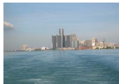
Detroit River Waterfront

Much pollution prevention and cleanup has occurred as a result of the 1972 U.S. and Canada Great Lakes Water Quality Agreement and the 1972 Clean Water Act. In the past 34 years there has been a more than 98% reduction in oil discharges, a 95% reduction in phosphorus discharges from the Detroit Wastewater Treatment Plant (one of the largest in North America), a 70% decline in mercury contamination of fish, and an 83% decline in PCB contamination of herring gull eggs from Fighting Island in the Detroit River. Pollution prevention and cleanup of the Detroit River by the U.S. and Canada, as well as scientific research, have contributed to the restoration of reproducing populations of peregrine falcons, lake sturgeon, and bald eagles, a greatly improved walleye fishery, and a potentially recovering whitefish population. This is great news for the Detroit River, the Refuge, and the Great Lakes!