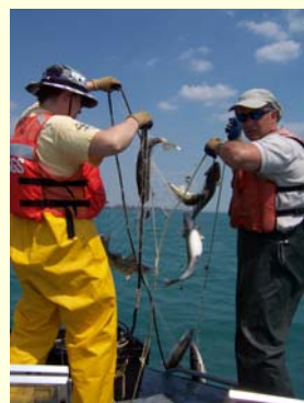
Scientists capture native walleye in the Detroit River.